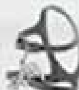
Nasal Mask & Full Mask (Optional) tube